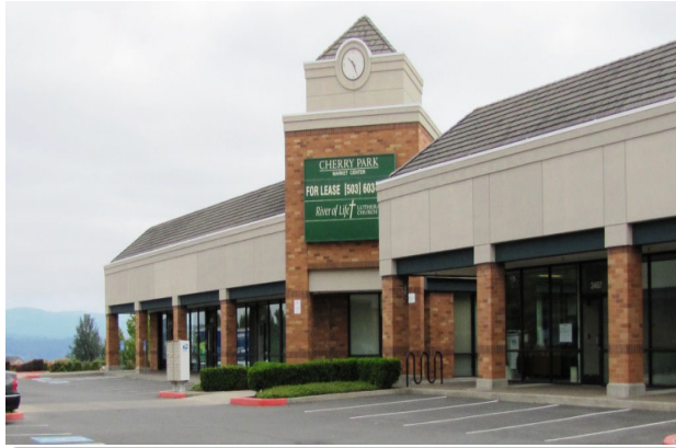
A strip of vacant commercial property at Cherry Park Plaza.