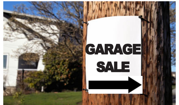
The photos above and below are two examples of signs that are in violation of Troutdale Municipal Code 10.025. You can place your sale sign on private property with permission of the property owner. Be sure not to attach any sign to utility poles or signposts (above), or place in the public right-of-way (below).

Code Enforcement has the authority to issue citations in these cases. However, with the public's cooperation, enforcement won't be necessary, and I can tend to the highest priority livability issues that have a greater impact on your safety.