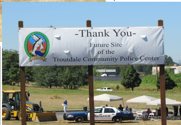
City officials, dignitaries, residents and City staff begin gathering for the Troutdale Community Police Center Groundbreaking Ceremony, held August 17, 2011.