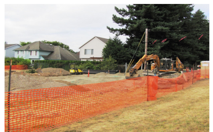
Construction of two parking lots at Sunrise Park will be completed by the end of September.

As part of the Troutdale Parks Master Plan adopted in 2006, a concept development plan for Sunrise Park was also adopted. Since that time, various improvements shown in the concept plan have been incrementally added to the park to enhance the public's use and enjoyment of it. Among the improvements made so far are